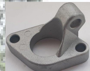
Bracket Valve Bank