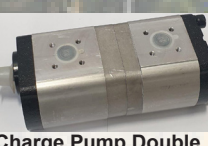
Charge Pump Double 22.5 - 19cc