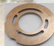
Wafer Plate TA1919