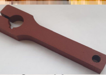
Control Arm TA1919