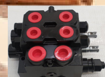
Valve Bank Double