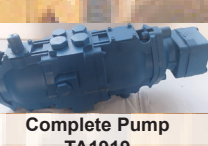
Complete Pump TA1919