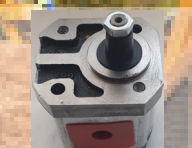
Charge Pump Single 22.5cc