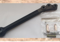
Handle Kit Valve Bank